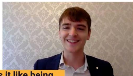
What's it like being a prison chaplain?

Watch the short film here to find out more about this amazing movement.