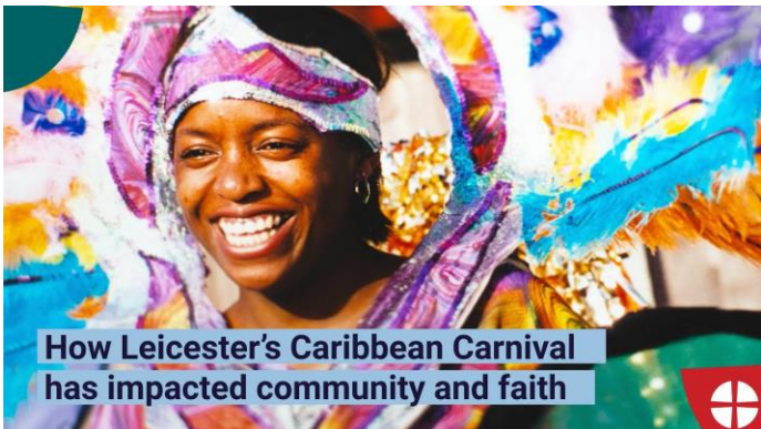
How Leicester's Caribbean Carnival has impacted community and faith